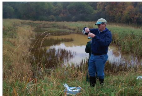
Water quality testing at an acid mine drainage site.

The Headwaters RC&D Council area covers Cameron, Centre, Clearfield, Clinton, Elk, Jefferson, McKean, and Potter Counties. An office located in DuBois, PA houses Council staff who assist the Council in achieving its goals.