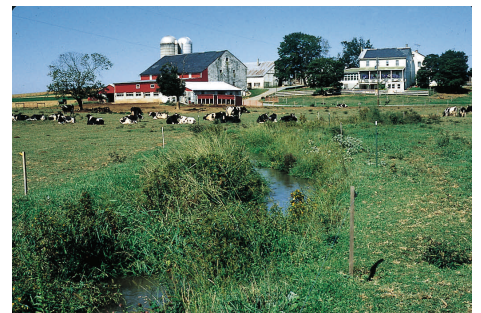
On-farm practices, such as streambank buffers, protect water quality.

Quarterly RC&D Council meetings are held on the 4th Tuesday in January, April, July and October, and rotate throughout each of the eight Counties it serves. Board membership is made up of delegates chosen by each County's Board of Commissioners, Conservation District and Planning Department. At-large positions are also available to represent the population of the entire Headwaters RC&D area.